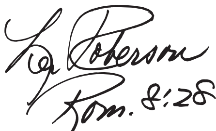
Highland ark Baptist Church Chattanooga, Tennessee